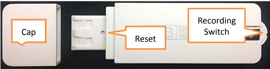
Figure 2: Side B