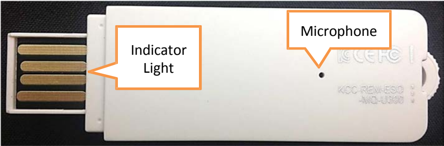
Figure 1: Side A